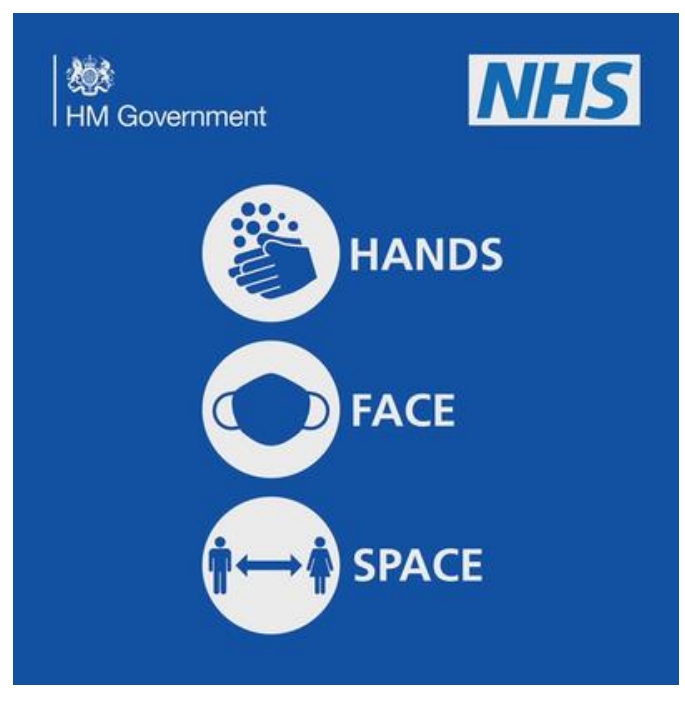
NHS and HM Government (2020)